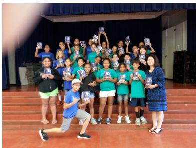
Anuenue Elementary Class

Monday, the last meeting of the month was our Fellowship meeting bringing us up to date with our future programs, etc. One of the main projects we have been involve is the Dictionary Project for the third graders Anuenue Elementary, Montessori and Waialae Charter Schools,