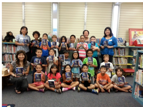
Waialae Charter School